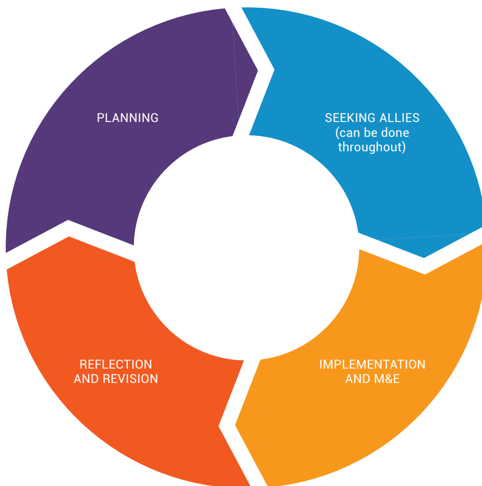
FIGURE 2 - The tool is organized by stages of the program cycle

It is important to note that not all of these recommended steps will be possible or appropriate for all CSOs to implement in their respective initiatives. CSOs must use their own judgment to determine whether a particular strategy would be relevant and effective.